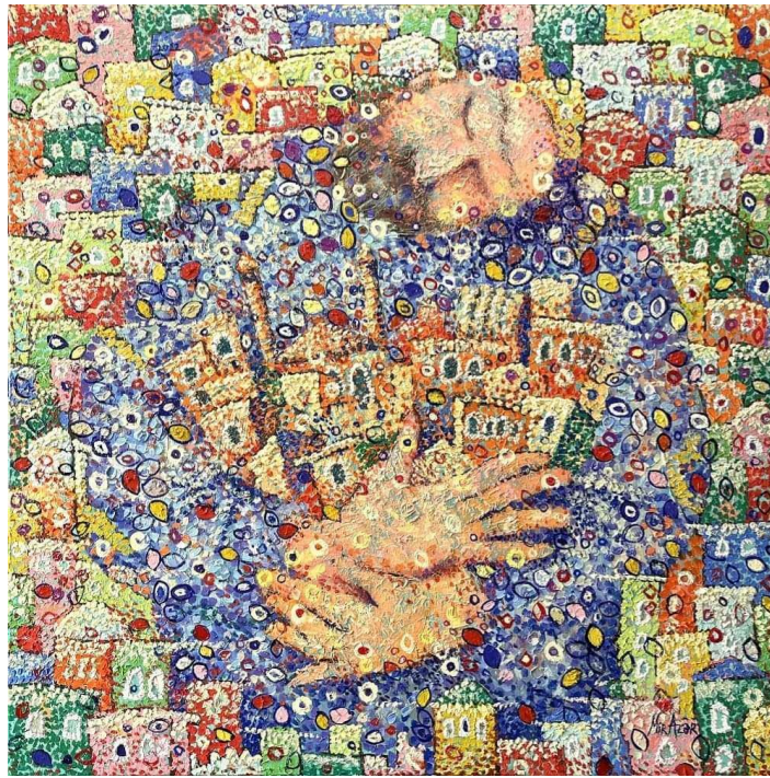
Fig 1. Mir Azer Abdullayev "Meeting" (canvas, oil paint, 100x100 cm)

"Shusha" (fig 2) was executed by Mir Azer on canvas with oil painting technique. In the struggle for the capital of culture, the dynamism of the horse is surrounded by buta patterns.