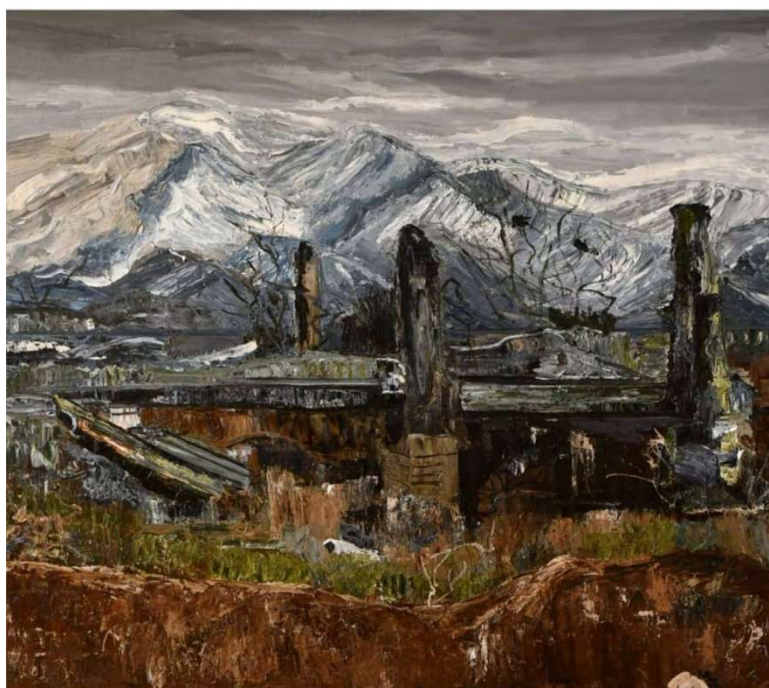
Fig 6. Nigar Helmi "Aghdam bridge" (canvas, oil paint, 110x110 cm)

A part of the destroyed "ghost city" in the work "Aghdam Bridge" was revived by Nigar Helmi's brush. (fig 6)