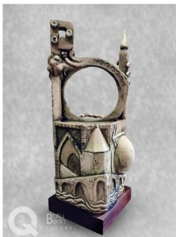
Fig 5. Imran Karimov "Karabakh Chronicle" (2021) (ceramic, 90x32x32 cm)

A part of the destroyed "ghost city" in the work "Aghdam Bridge" was revived by Nigar Helmi's brush. (fig 6)