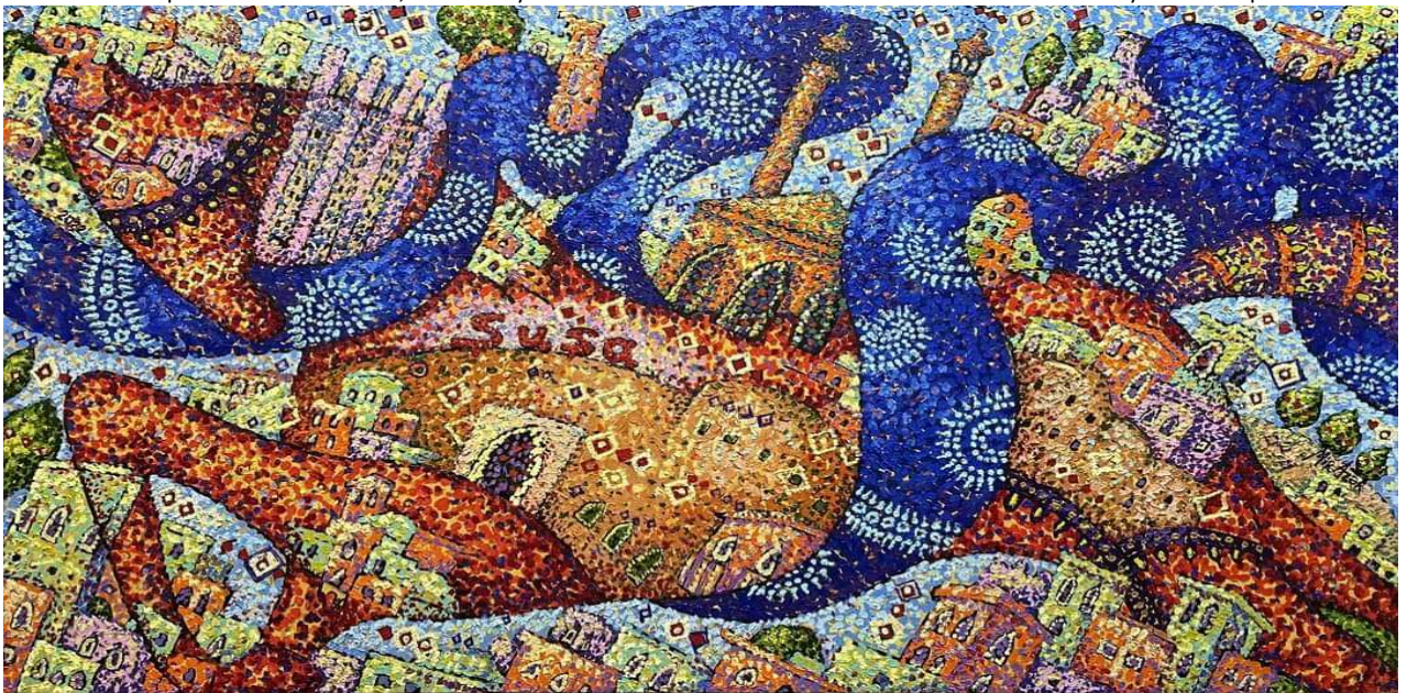
Fig 2. Mir Azer Abdullayev "Shusha" (canvas, oil paint, 75x130 cm)

"Shusha" (fig 2) was executed by Mir Azer on canvas with oil painting technique. In the struggle for the capital of culture, the dynamism of the horse is surrounded by buta patterns.