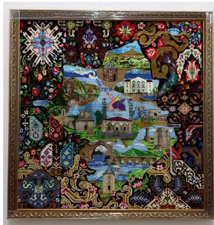
Fig 3. Eldar Hajiyev "Map of Karabakh"

After Armenia occupied Shusha on May 8, 1992, the city was destroyed. They tried to present Shusha as an "Armenian city". The cultural capital of Azerbaijan was liberated from foreign invaders on November 8, 2020. After Shusha was freed from occupation, reconstruction began. In the composition "Shusha", Asmar Narimanbeyova presents to the audience the ruins of our cultural heritage, which were subjected to the Armenian vandalism of history. The contrast of colors against each other is the struggle of good and evil. (fig 4)