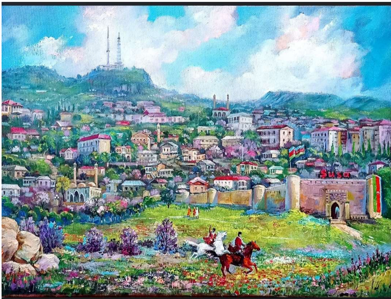
Fig 3. Khuday Ibrahimov "Shusha" (canvas, oil paint, 60x40 cm)

The history of Shusha, the cultural capital, is different in Mir Azer Abdullayev's work "Jidir plain" (fig 4). We are watching the composition, which turns into the colors of freedom and the air of mood. Image, line, colors based on rhythmic repetition become the plot line of the work.