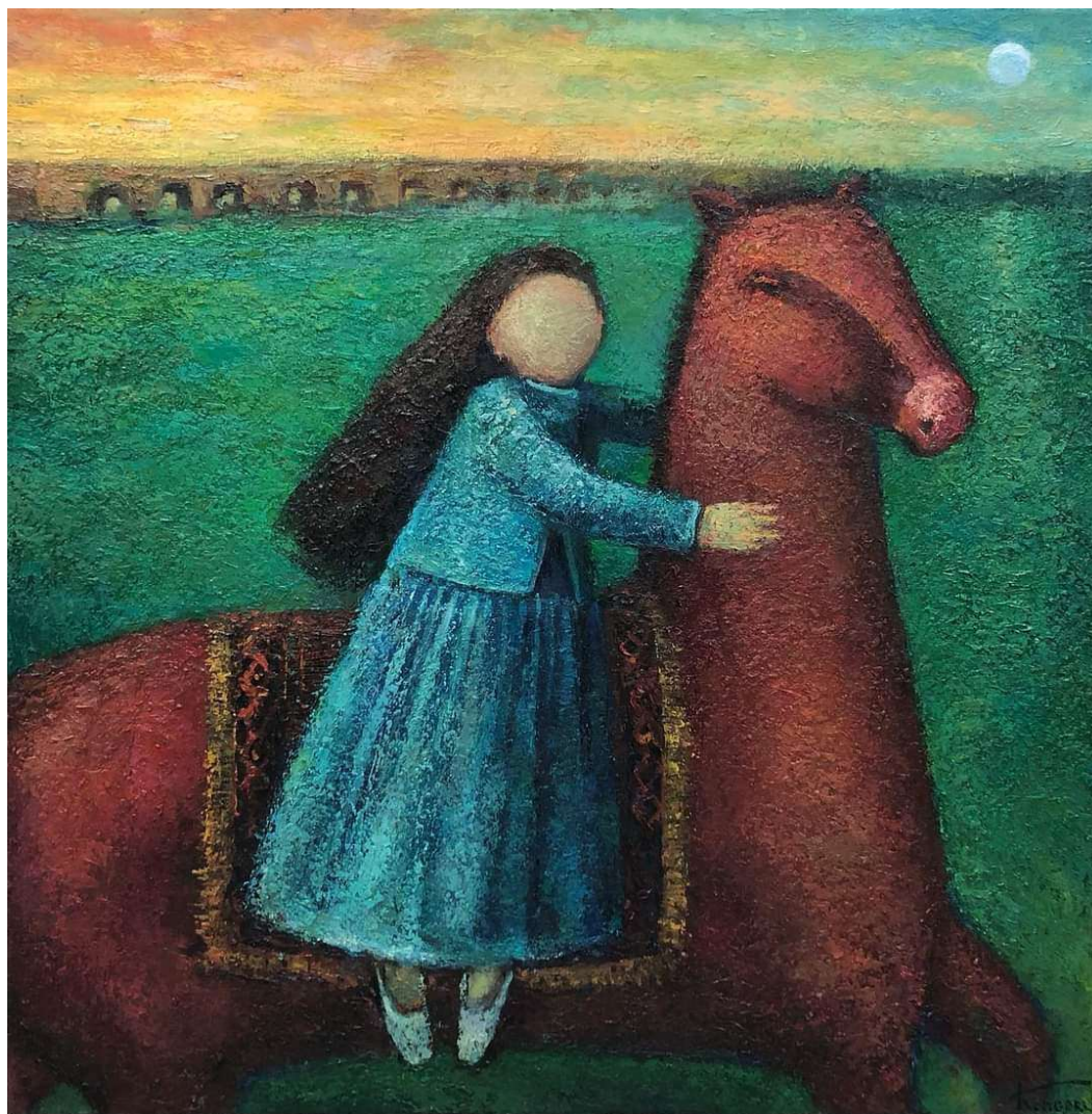
Fig 1. Bahruz Kangarli "The Tale of Khudafar" (2022) (canvas, oil paint, 100x100 cm)

Each of the works included in the series "The Beauty of Karabakh" (fig 2) by Elchin Huseyn emphasizes the historical land of Azerbaijan. The unity of the Karabakh horse and carpet art is the embodiment of the return to the native land. In the work, red color stands out as a symbol of struggle.