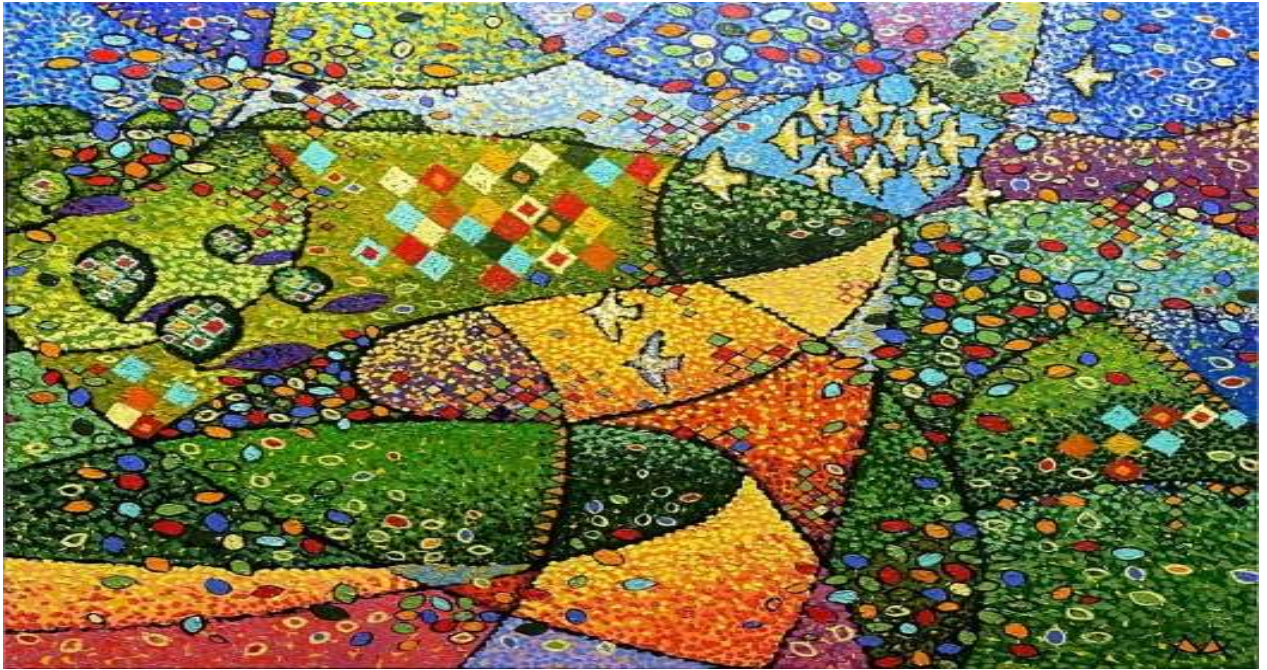
Fig 4. Mir Azer Abdullayev "Jidir plain" (canvas, oil paint, 100x100 cm)