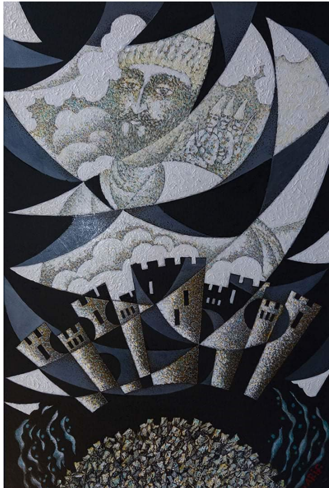
Fig 1. A. Huseynov "Dedication to Agdam" triptych "Shahbulag Castle" (2021) (canvas, acrylic, 60x90 cm)

https://www.icssietcongress.com/icssiet-2022