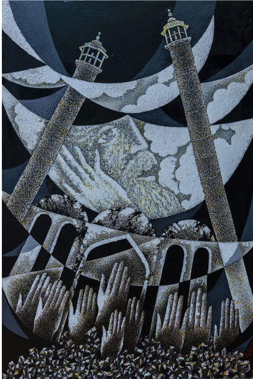
Fig 3. A. Huseynov "Dedication to Agdam" triptych "Destruction of Agdam Theater" (2021) (canvas, acrylic, 120x90 cm)

Huseynov's composition presented the image of the martyrs who saved the destroyed mosque with their own hands to the sound of the call to prayer.