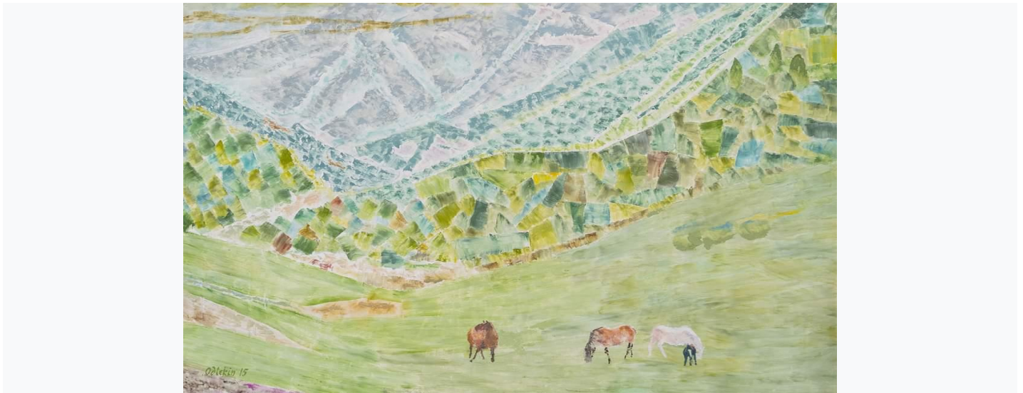
III 6. Odtekin Agababayev “Kalbajar” (canvas, oil paint, 83x115 cm)