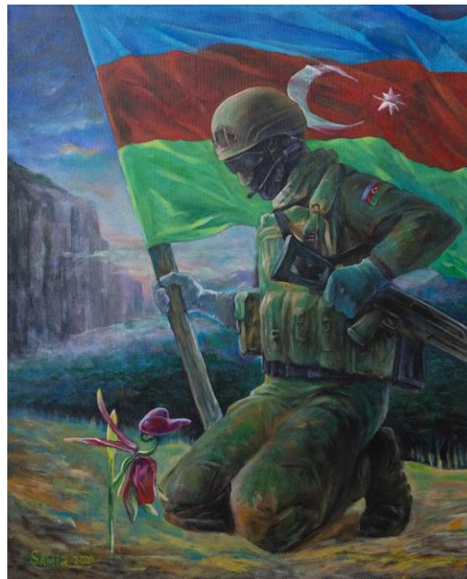
Ill 2. Samir Gafarov “Kharibulbul” (2021) (canvas, oil paint, 90x80 cm)

In "Return" (ill. 3), Vusala Sharifova based the return of the horses, which were considered a symbol of strength and power, on the liberated lands, and on the color scheme typical of the miniature style. The solution of cold and warm colors is a struggle between good and evil.