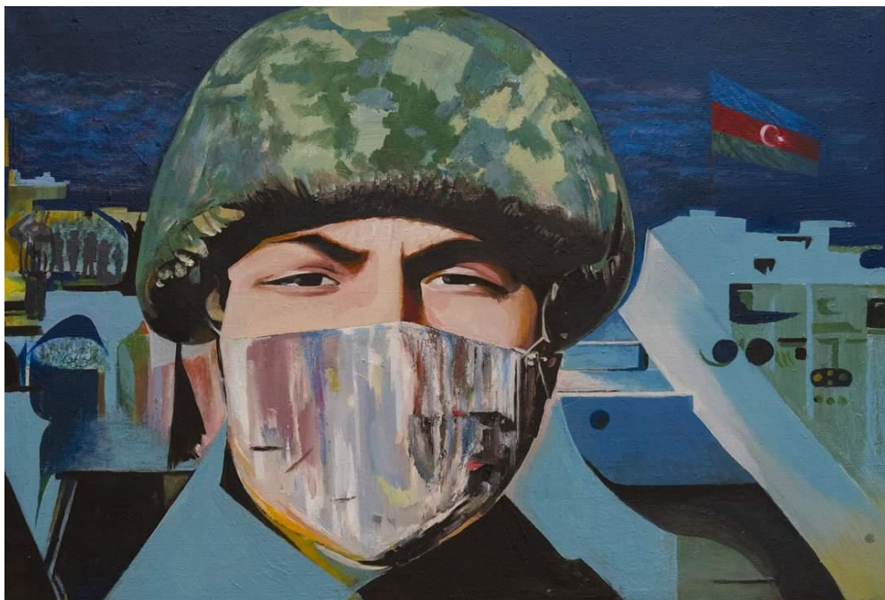
Fig 5. Mirza Habib Guliyev "Victory" (2021) (canvas, oil paint, 70x103 cm)