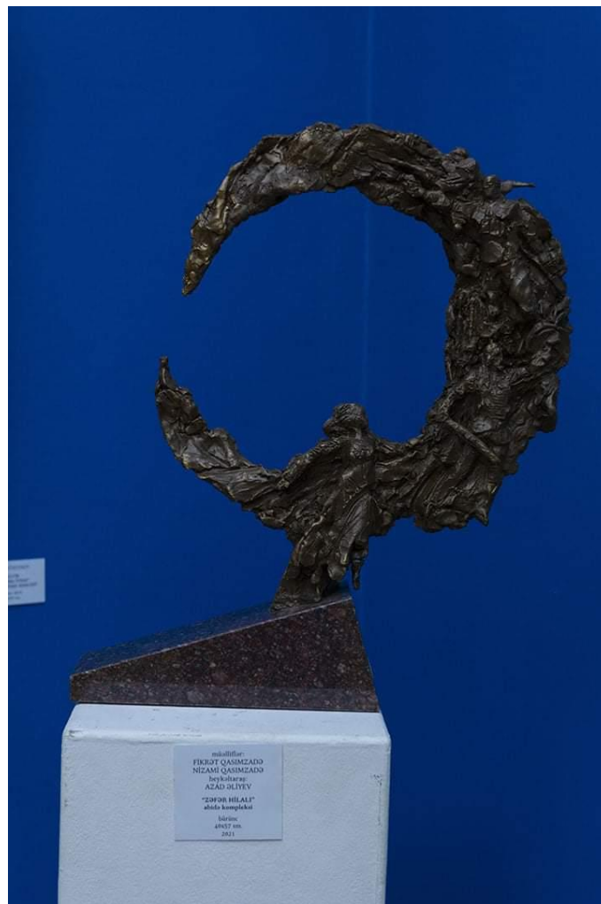
Fig 1. Azad Aliyev “Victory Crescent” memorial complex (2021) (bronze, 40x57 cm)

Colors, plastics, decorative-applied art samples bring to life the impact of the Victory in front of the audience. The development of this theme in Azerbaijani sculpture was based on the solution of a new image on the part of our artists. Monument complex "Victory Crescent" (fig 1) authored by Azad Aliyev is distinguished by the predominance of the texture of bronze material. The sculptor, who chose a woman as the main character, completed the background with a crescent symbol. He combined the concepts of motherland and homeland in one composition. The path of our heroes defending the homeland on the crescent in the struggle for victory is distinguished by its sequence. The idea given to the image of the mother in the composition is interesting, the victory of our heroes with her prayer creates dynamics on the crescent.