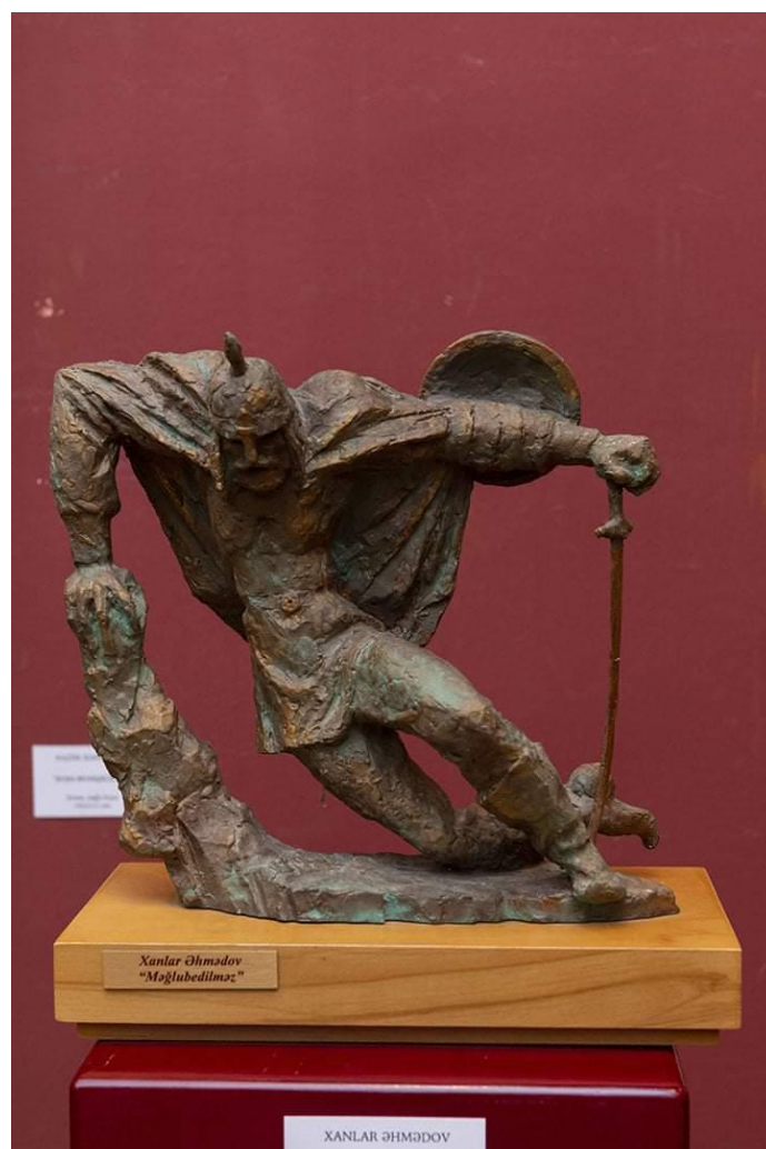
Fig 2. Khanlar Ahmadov “Invincible” (polyester, 30x25x15 cm)

The theme of victory in Azerbaijani painting has a wide range. Natig Farajullazadeh created a festive atmosphere in Karabakh in his works "Kharibulbul" (fig 3) and "Novruz" (fig 4). National patterns, design of clothes, description of jewelry patterns are distinguished by special imagery. The blossoming kharibulbul is a sign that a new breath has come to our free lands.