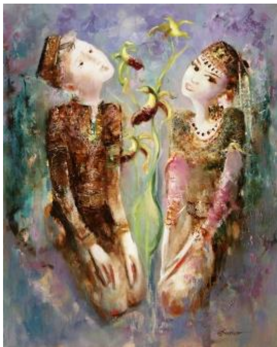
Fig 3. Natig Farajullazade “Kharibulbul” (2020) (canvas, oil paint)