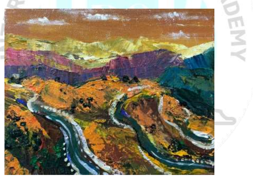
ILL 5. Bahruz Kangarli "Shusha road" (2020) (canvas, oil paint, 19x24 cm)