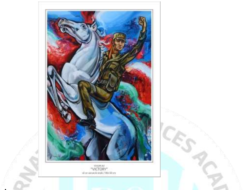
İll 1. Vugar Ali "Victory" (2020) (canvas, acrylic, oil paint, 90x130 cm)